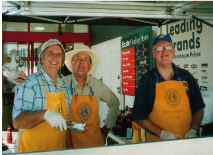
Beaumaris Lions Club members wield the tongs at a sausage sizzle for the Cord Blood and Childhood Cancers Appeal. It's another example of the projects the club has been involved in over 36 years.