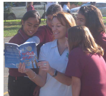
'Netball Dreamz' appeals to all ages in Australia's most popular sport.